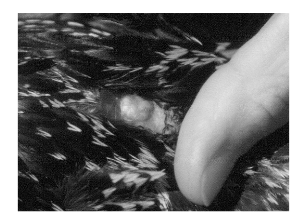
Fig. 1. Cutaneous cyst on the abdomen of Sturnus vulgaris . Actual size.

The metacestodes were of variable shape (Fig. 2), mostly longitudinally elongate, 2.30–8.53 mm (5.29 \pm 1.62 mm, n = 22) long and 1.31–2.84 mm (1.88 \pm 0.38 mm, n = 22) wide. Their scoleces exhibited various degree of invagination. Four suckers with a diameter of